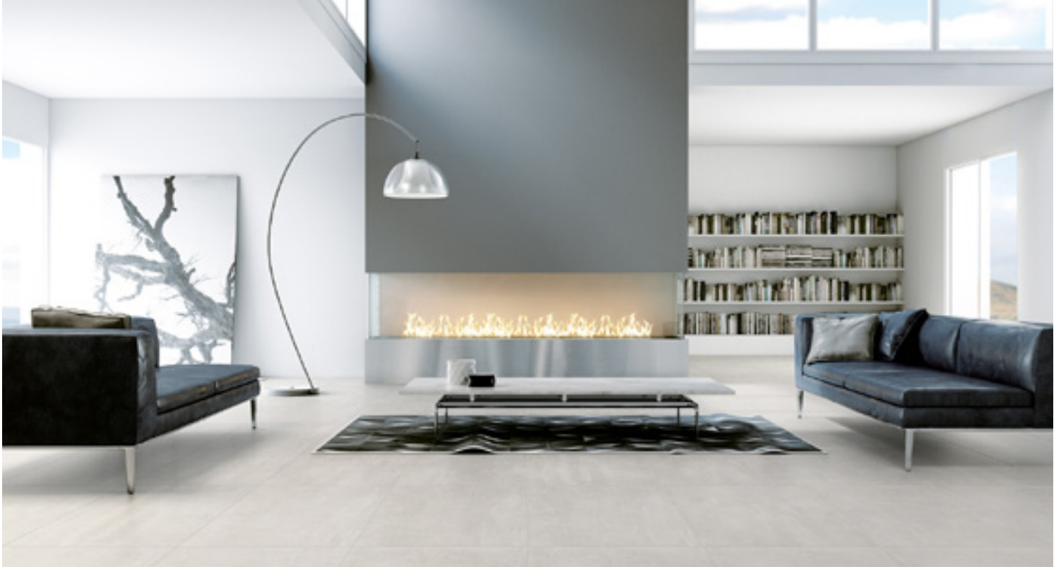
MANHATTAN (LIGHT GREY)