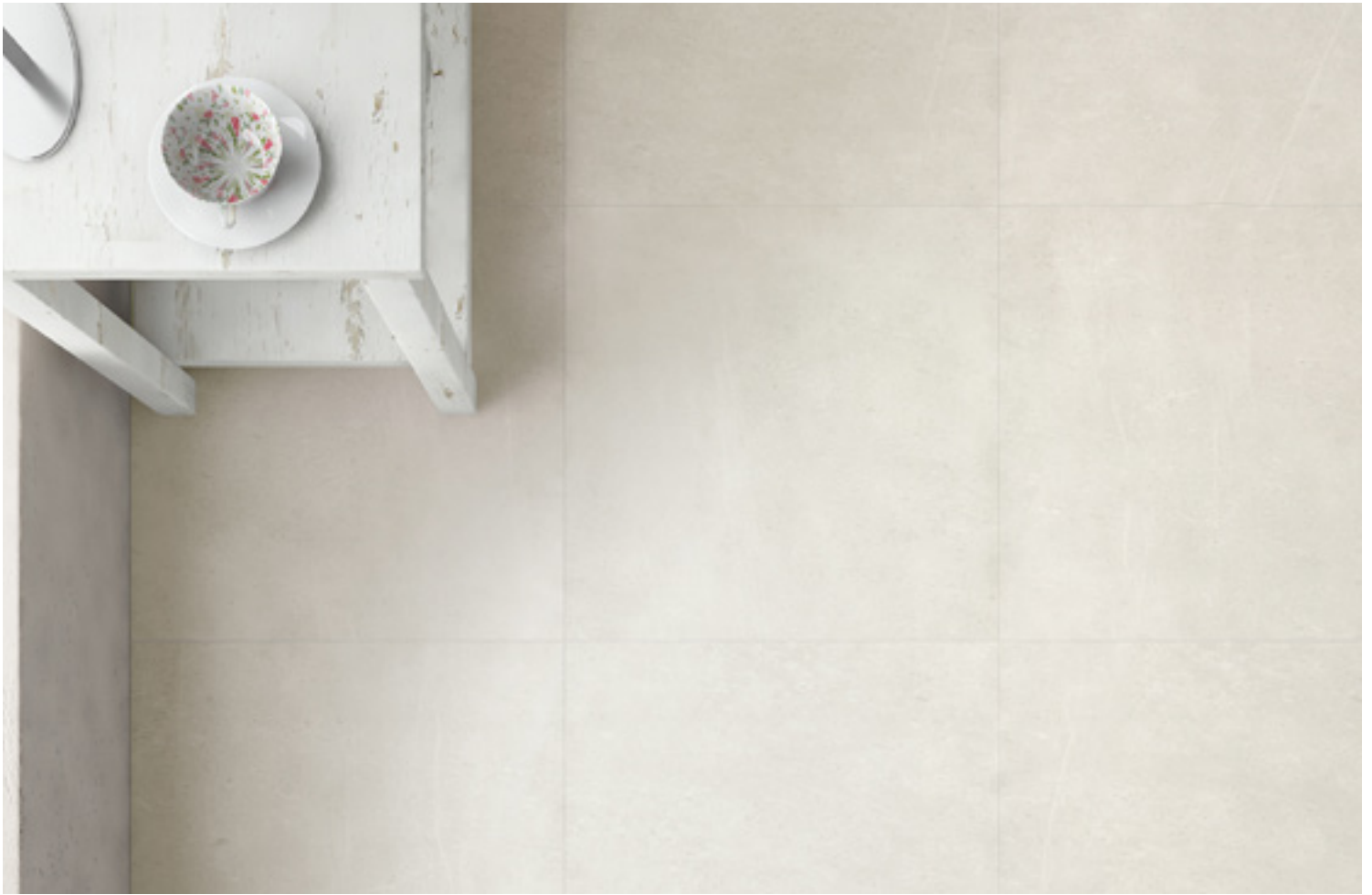
SUGAR HILL (WHITE)